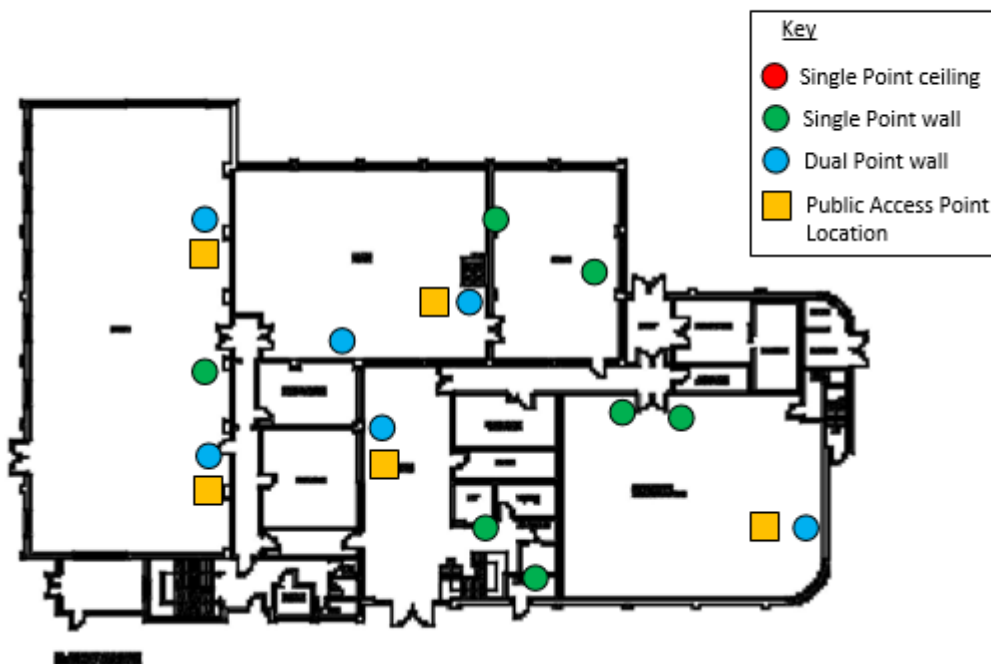
Museum Stores – Ground Floor